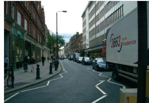
The future of sub-prime? Chelsea in London.

On April 17th 367 members of Brazil's 513-strong congress voted to impeach the country's President, Dilma Rousseff. The vote was prompted by the fact that Rousseff is accused of making a temporary transfer from state banks to the national accounts directly before the last election. Meanwhile, 150 deputies in Congress are accused of crimes including money laundering, perjury and fraud but enjoy immunity as elected officials.