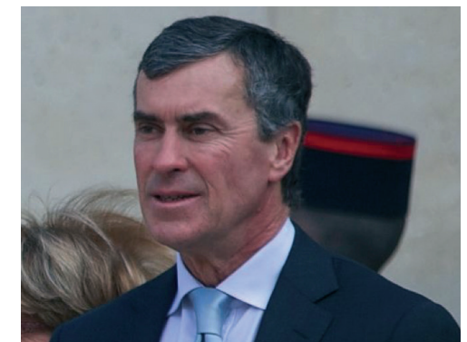
Jérôme Cahuzac, former Minister of the Economy, Finance and External Trade in Hollande's administration in France.

In February the trial of former French minister Jérôme Cahuzac was scheduled to begin. The politician, who was appointed by President Hollande in 2012 to lead a crackdown on tax avoidance and evasion, faces allegations that he illegally hid €600,000 in a Swiss bank account.