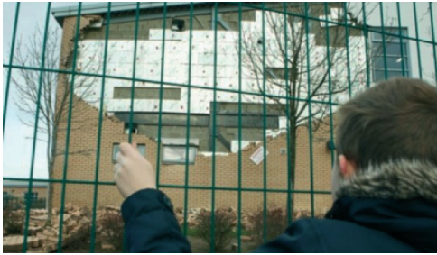
A painfully appropriate metaphor... A Scottish school, built under the PFI, in a state of collapse, April, 2016.