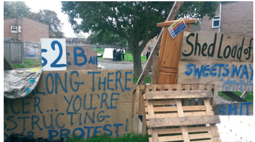
Sweets Way 23 September, 2015: activists put up barriers, in response to the fencing off of houses, as Annington Homes prepares to demolish the estate. Police congregate outside last remaining tenant's house.

Adding insult to injury, when Sweets Way residents approached their local authority about their rehousing 'options', Barnet council told them that they had to make a formal homeless application – to be eligible