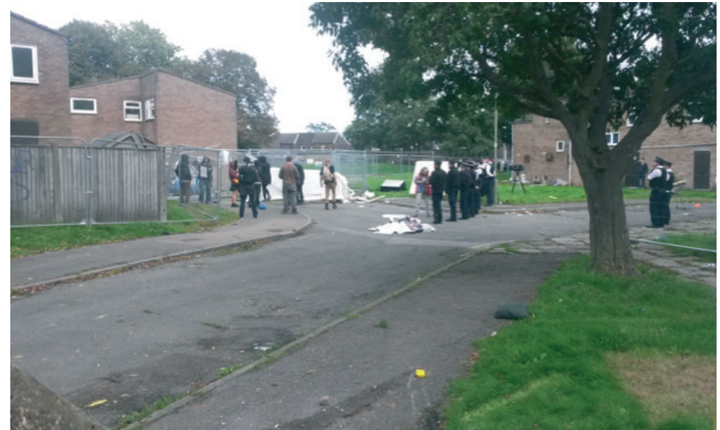
Sweets Way 23 September, 2015: activists put up barriers, in response to the fencing off of houses, as Annington Homes prepares to demolish the estate. Police congregate outside last remaining tenant's house.

“The Metropolitan Police estimate that £180 million worth of UK property is used for money laundering, but it too concedes that this is ‘just the tip of the iceberg’”