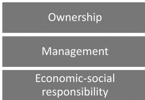
Figure 1: Ownership and management structures in the 18 th and 19 th Centuries (“patriarchalism”)

In Finland the major change from this traditional way of managing business and employees took place only in the 1960s and 1970s, when many companies more or less systematically wanted to get rid of the responsibilities described above. This was partly due to return requirements of banks and other financiers. Also, it was due to the development of the social security system and the new social responsibilities of the municipalities – in short, the Nordic welfare state model. This process and change can be described in the following figures: